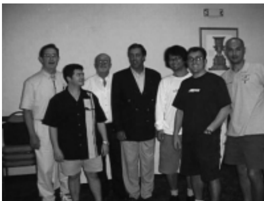
The Wakeboard Council with IWSF President in the middle.